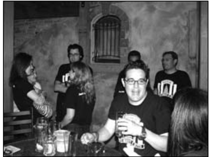
Happy crawlers show off their colors.