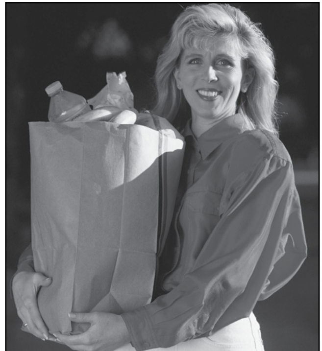
"As little as picking up a couple nonperishable food items—beans, pasta, rice, vegetables, or tuna—at the grocery while shopping for yourselves can help out."

Consider that most churches and other religious organizations are supporters of fundraisers and other philanthropic efforts throughout our nation and our own local